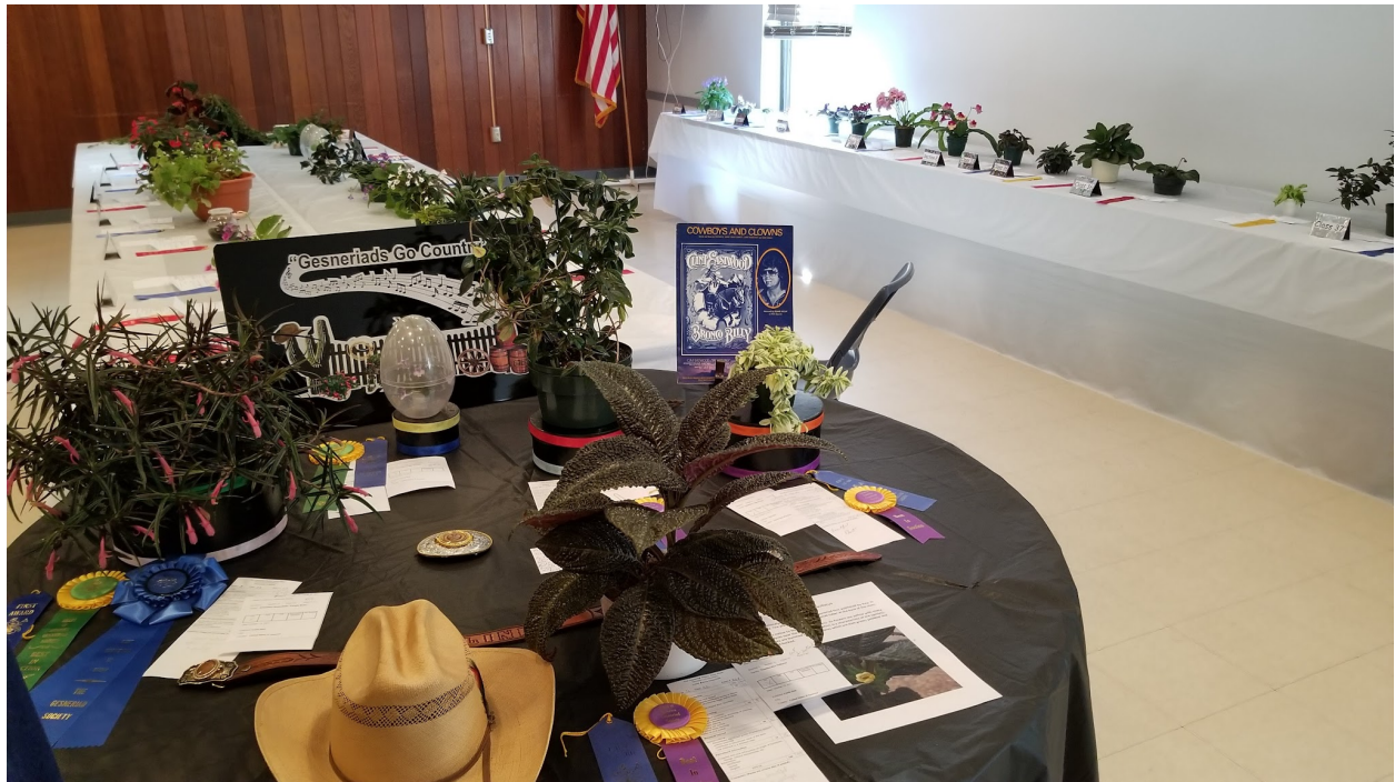
Below: Winners table and showroom